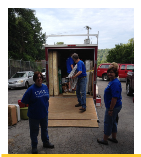
First Presbyterian and United Methodist group deliver donations

The First Presbyterian Church of Irwin and the Community United Methodist Church sit only five minutes away from each other in Irwin, Pennsylvania. United in their